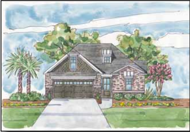
Alternate Elevation w/o Golf Cart