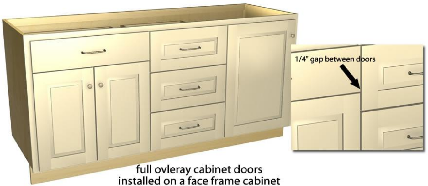
full overlay cabinet doors installed on a face frame cabinet